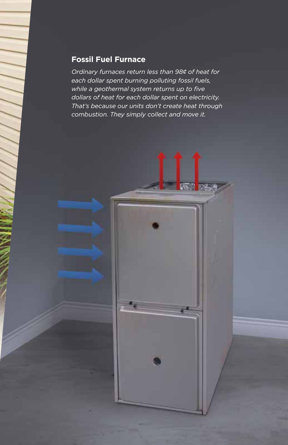
Fossil Fuel Furnace Ordinary furnaces return less than 98¢ of heat for each dollar spent burning polluting fossil fuels, while a geothermal system returns up to five dollars of heat for each dollar spent on electricity. That's because our units don't create heat through combustion. They simply collect and move it.