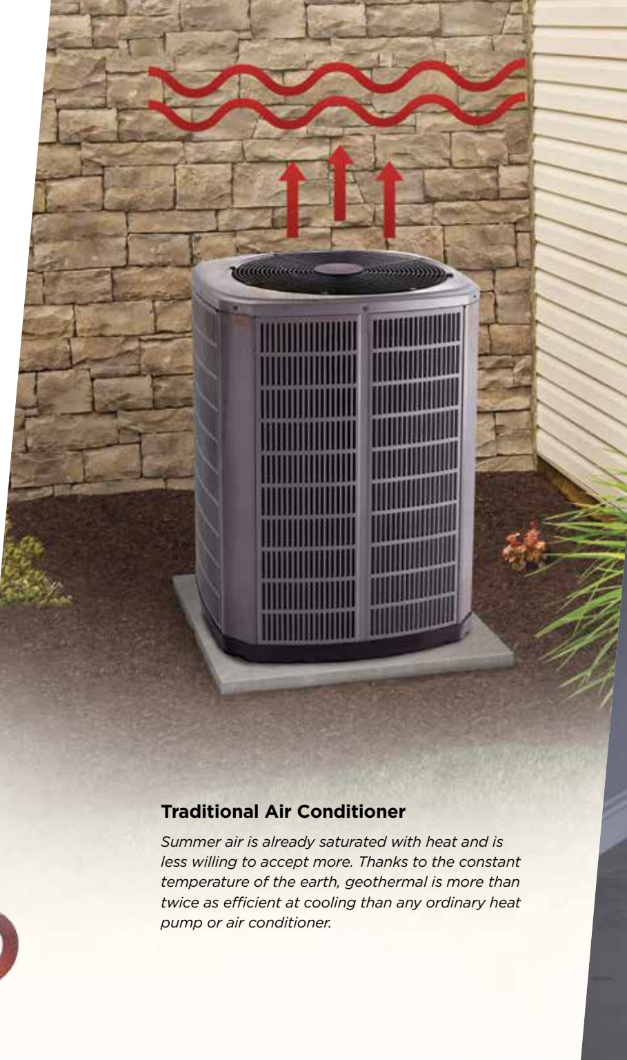
Traditional Air Conditioner Summer air is already saturated with heat and is less willing to accept more. Thanks to the constant temperature of the earth, geothermal is more than twice as efficient at cooling than any ordinary heat pump or air conditioner.