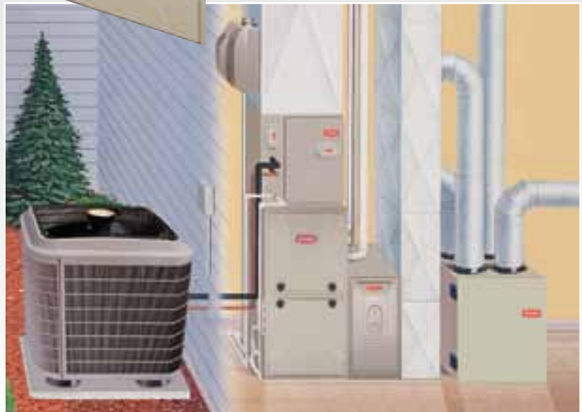
HYBRID HEAT® Deluxe Heat Pump and Deluxe Gas Furnace System