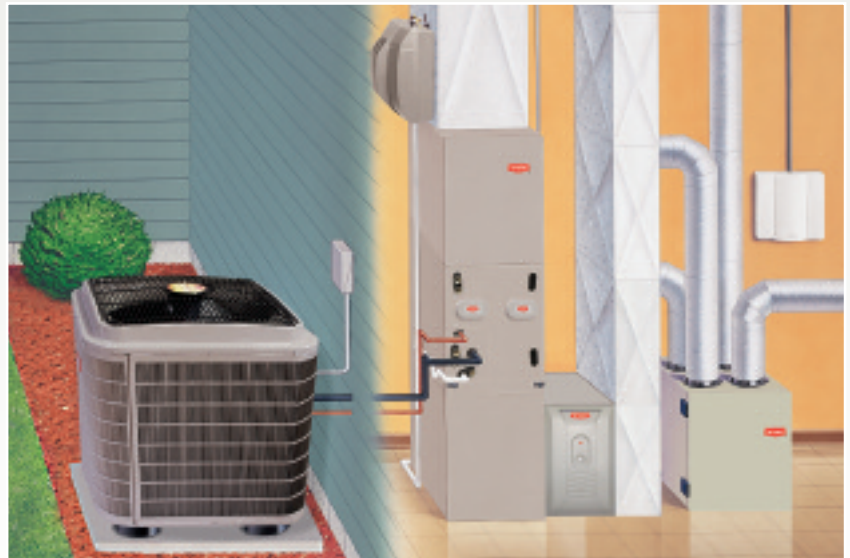
Heat Pump and Fan Coil System